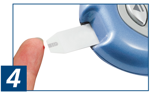
With Test Strip still in Meter, touch Sample Tip to top of blood drop and allow blood to be drawn into Test Strip. Remove from blood drop immediately after the Meter beeps and dashes appear across Meter Display.