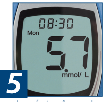
In as fast as 4 seconds, glucose result will be displayed with time.